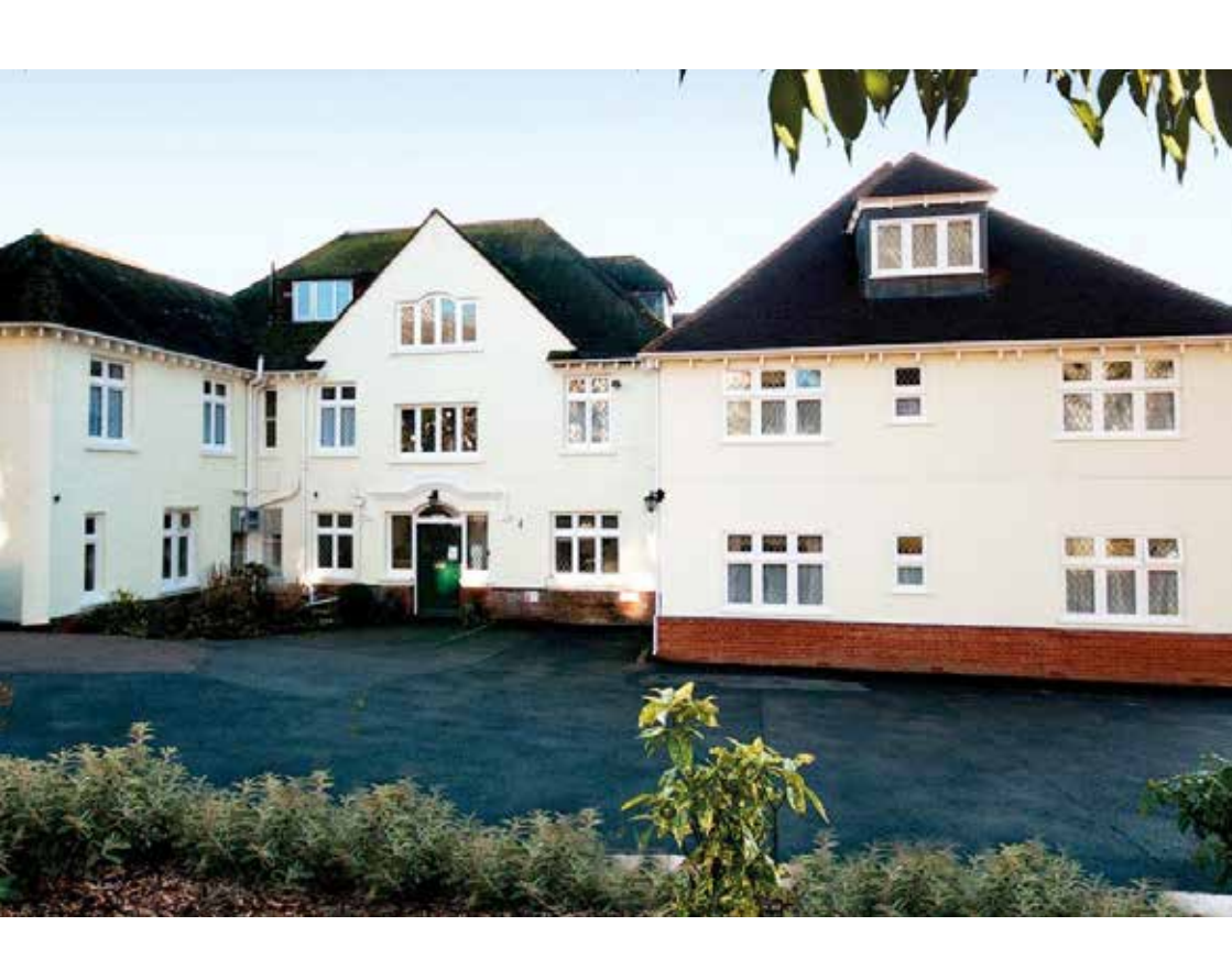
Traditional Care by the sea